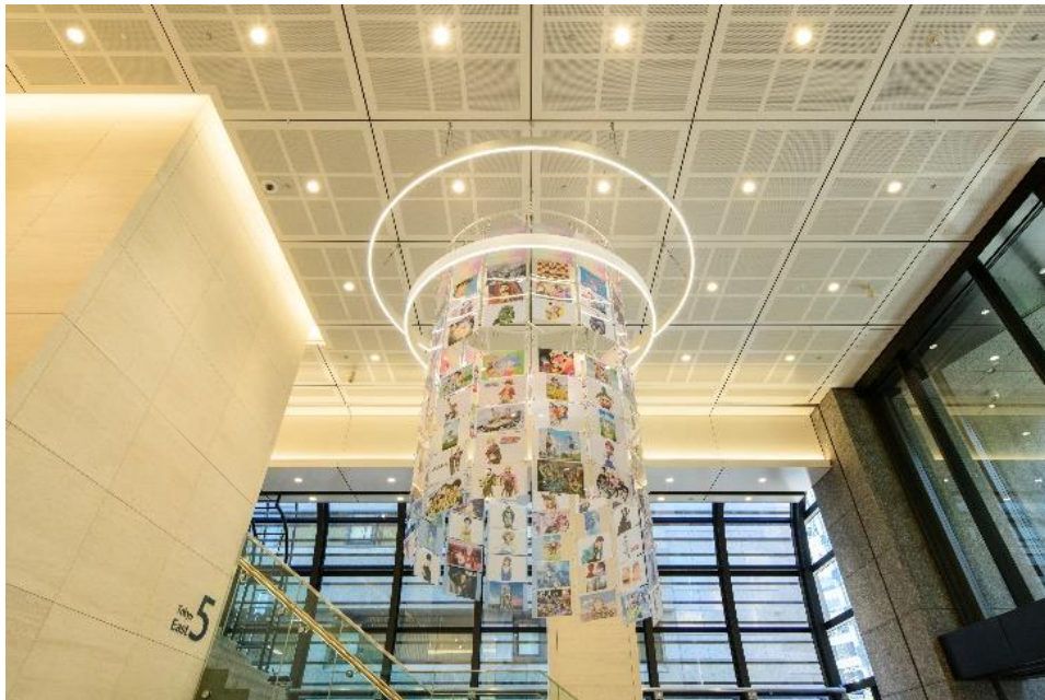
Symbolic artistic installation on the 1st floor of Anime

Please visit Anime Tokyo Station and indulge yourself in the allure of anime.