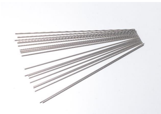
“TK-SK” product image

640HV Hardness: This palladium alloy offers maximum hardness of 640HV, making it ideal for use in test socket applications, particularly in the final continuity testing stage (back-end process).